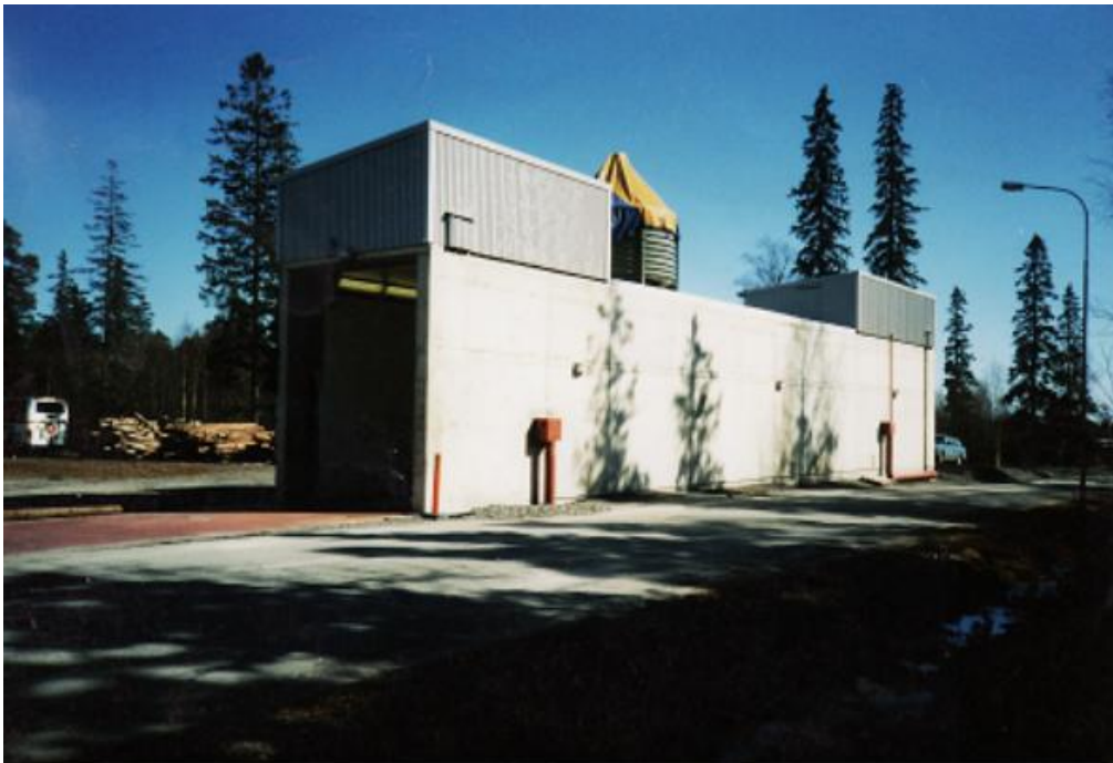
Figure 1.2. The first facility in Husum.

There exist a first test facility in Husum north of Örnsköldsvik in Sweden. The facility was complete but had technical difficulties that needed to be corrected. Unfortunately the company went into debt.