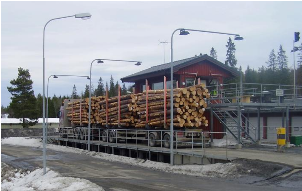
Figure 1.1. A traditional wood measurement station where traditional stick measurement is used.

Currently in Sweden the volume of wood is measured in an old fashioned method by inspectors who use their eyes and measurement stick. These people work for an independent organization called Virkesmätarföreningen (VMF) .